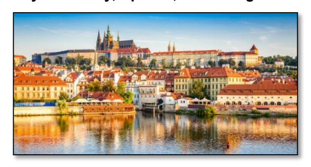
Day 3: Sunday, April 28, 2024: Prague

This morning we'll have the opportunity to attend an English-language church service or have free time. In the afternoon we will explore Prague Castle, a complex of palaces, courtyards, streets and churches including St. Vitus Cathedral, which took 600 years to complete. We will then take a stroll across Charles Bridge, past the famous statues to the Old Town Square. We will finish by the Jan Hus Monument, built to commemorate the 500th anniversary of his martyrdom. This evening we will have fun at a Czech dinner, including seeing folk dancing.